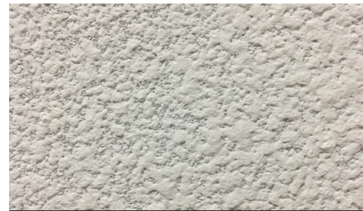
HEAVY ORANGE PEEL