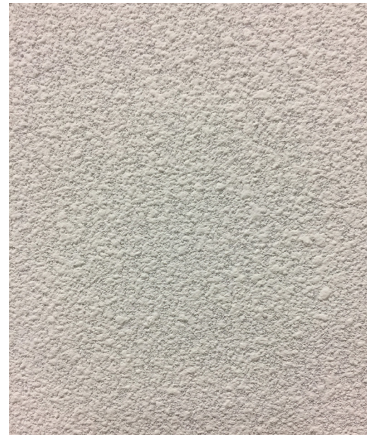
LIGHT ORANGE PEEL