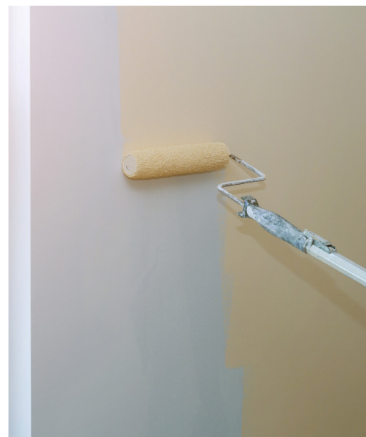
BRUSH, ROLL, OR SPRAY HI-BUILD.