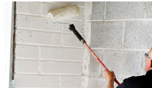
EFFICIENT COATING SYSTEM