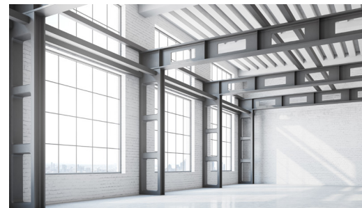
PRODUCTION INTERIOR BLOCK FILLER